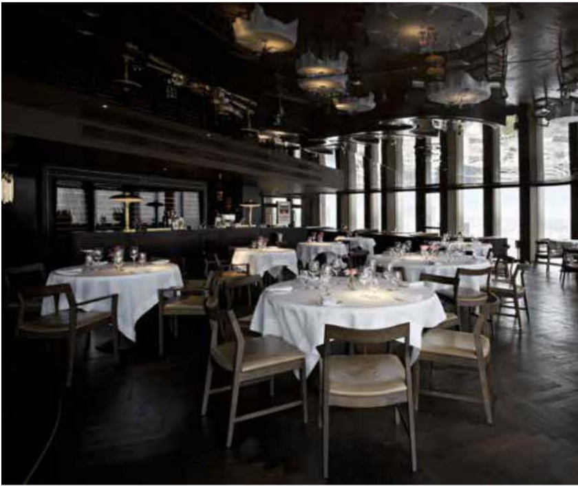
Impressive views of London