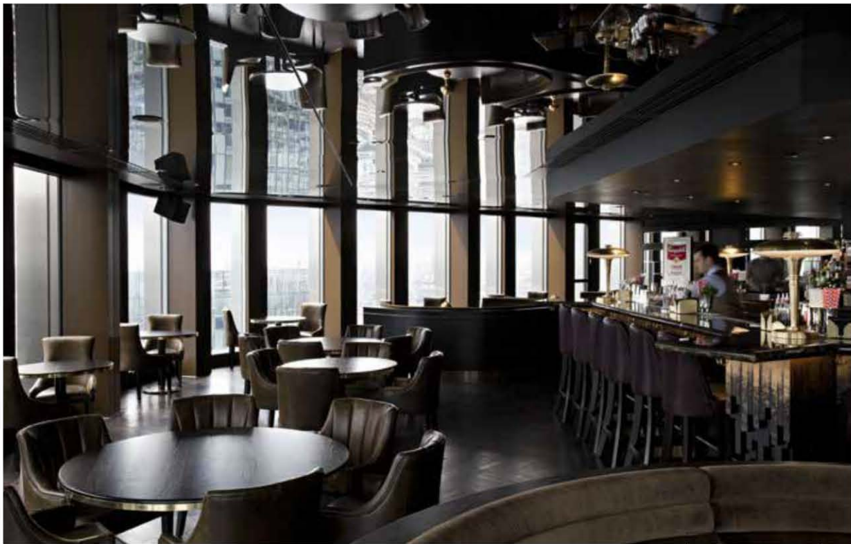
A multi-functional setting

“Akin to Atherton’s other bars, drinks are classic in their approach and are served in short glasses with a selection of Champagne cocktails on offer.”